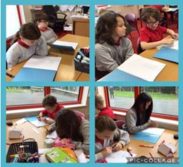
Playing decimal bingo