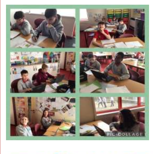
Times table relay, times table bingo and times table games.