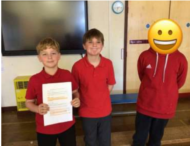
Sports Captains presenting for Road Safety Week